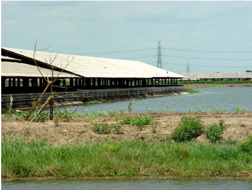
Figure 3. Using pig waste as fish feed

Moreover, the poor quality of the water means that only catfish can be bred. This alternative also requires considerable investment and labour and is generally inadequate in effectively disposing of the huge volume of waste produced by large farms.