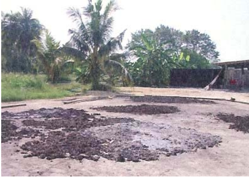
Figure 4. Drying the waste before selling it as organic fertilizer