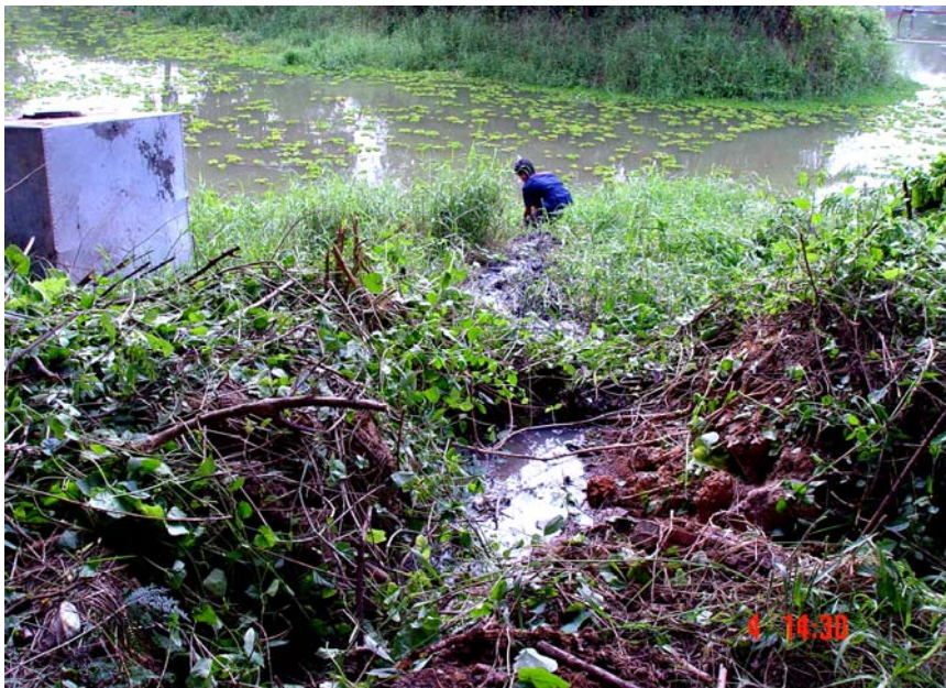
Figure 5. Dumping the waste into a deep pond

A small percentage of pig farmers, who have very limited spare land, dump their pig waste into a deep pond on their farms. These farms are always located away from the neighborhood, because the waste (which is left in the pond for years) gives off a very bad smell. Therefore, the local government has to enforce protective regulations on these farmers.