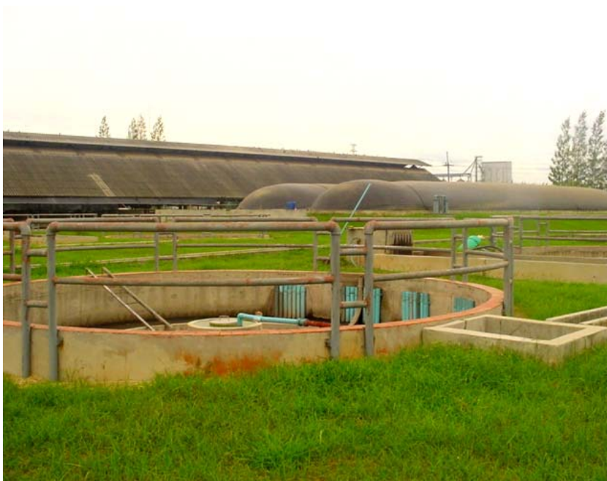
Figure 2. Converting the pig waste into biogas by means of a concrete dome digester

The use of biogas technology is intended to provide for the energy needs of the farm itself as well as to avoid the negative environmental impacts that other methods of pig waste disposal normally give rise to. However, this method has had limited success (see 1.3).